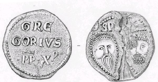
Lead Papal Seal of Pope Gregory X 1271-76 Found in Shalfleet Parish

Finds brought into the Archaeological Centre by detectorists and others are normally left with the Finds Liaison Officer whilst they are identified and recorded on the Portable Antiquities Scheme database. Only finds pre-dating 1700 are normally recorded. However, some later finds of local interest may also be recorded. All finds are returned to the finder(s) within two weeks at which time they are provided with a report for each object. Finders are credited with their discoveries but the locations of find-spots are always treated in confidence.